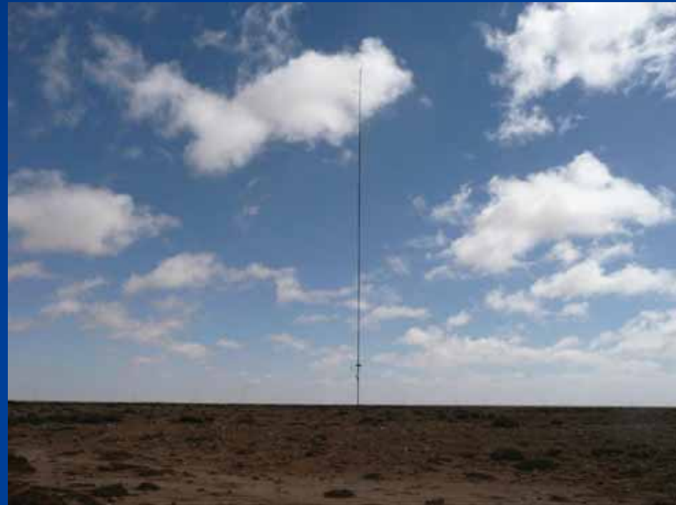
Area of Tarfaya